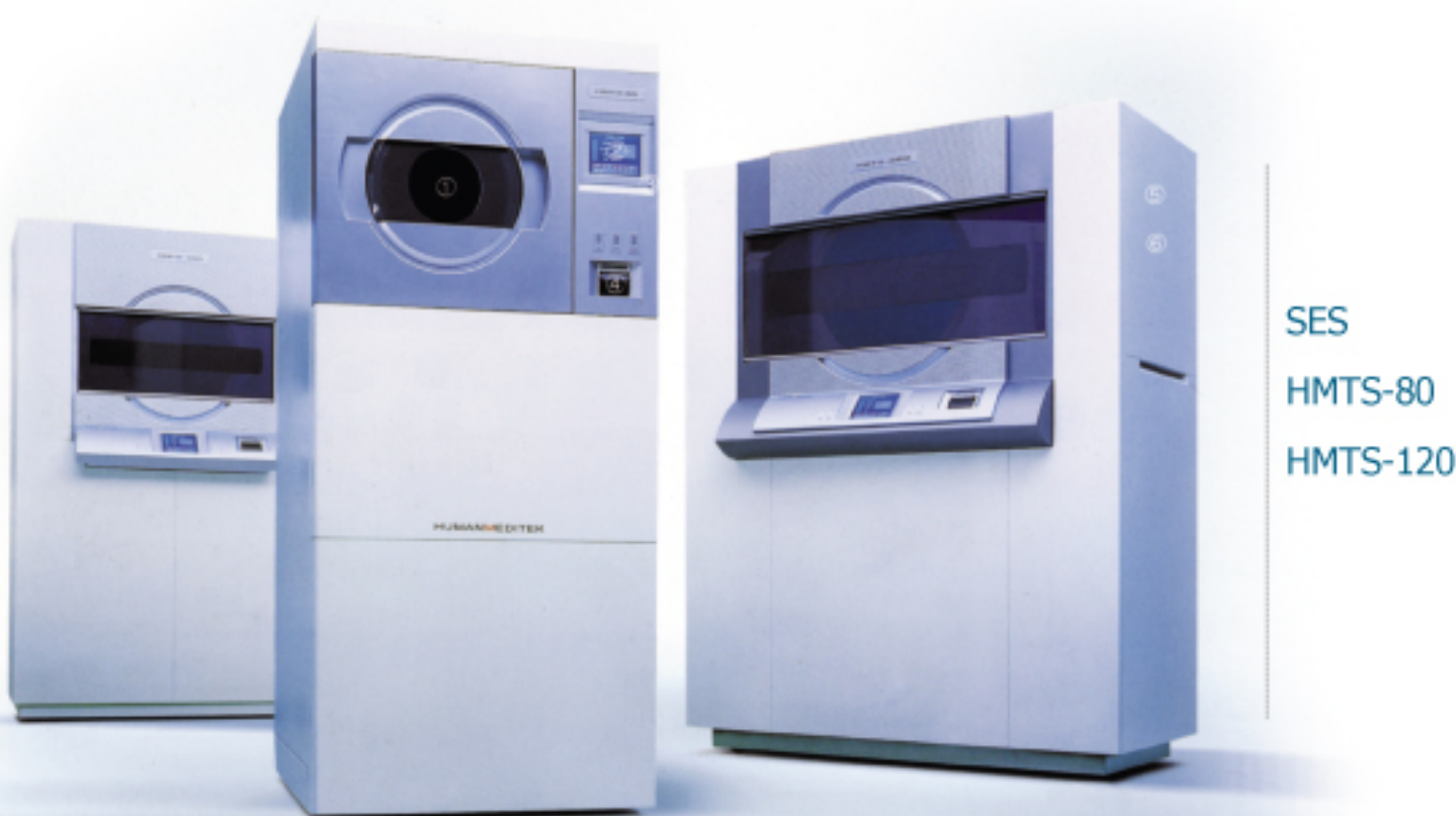
SES HMTS-80 HMTS-120